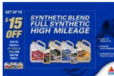
Counter Mat Frame with Insert