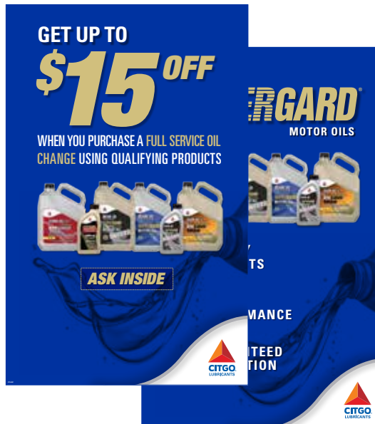
Double-sided Windmaster Sign