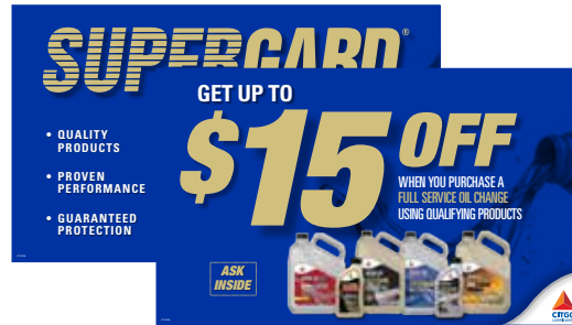
60 x 36 Banners